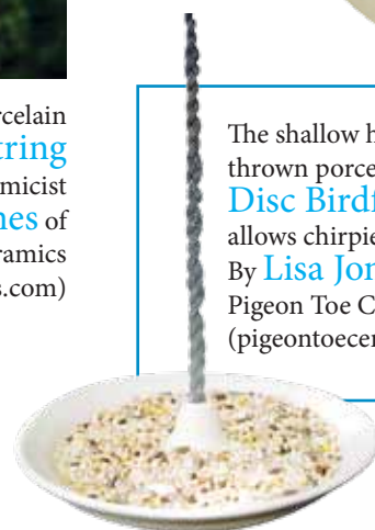
The shallow hand-thrown porcelain Disc Birdfeeder allows chirpies to perch. By Lisa Jones of Pigeon Toe Ceramics ( pigeontoceramics.com )

A refuelling & nesting site for tired / overworked bees, the Bee Station is available at beestation.com