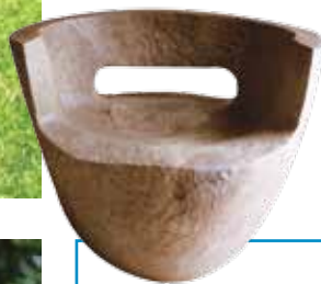
Denis Milovanov ( denismilovanov.com ) turns naturally fallen oak trees into organic shaped furniture