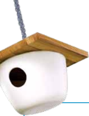
Scan Birdhouse by Lisa Jones of Pigeon Toe Ceramics ( pigeontoceramics.com )

These refined creations that redefine 'au naturel' outdoors are made of sustainable materials.