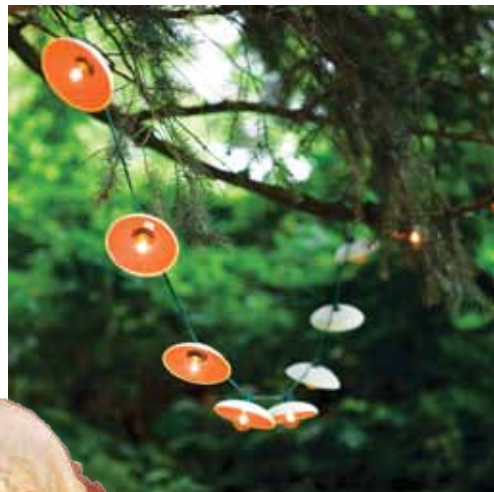
Hand-thrown porcelain shades, Disc String Lights by ceramicist Lisa Jones of Pigeon Toe Ceramics ( pigeontoceramics.com )